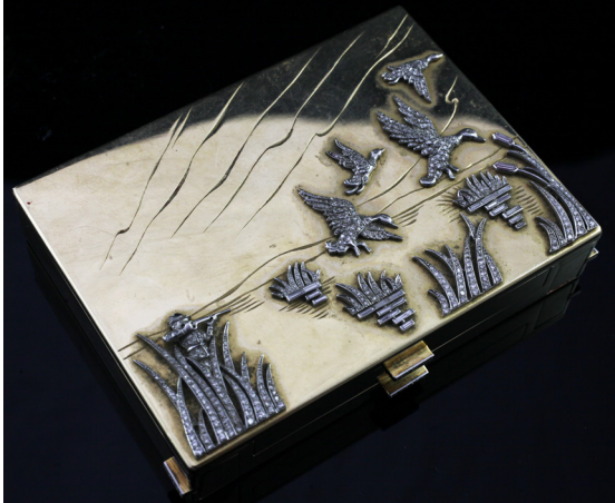
AMERICAN MINUADIERE £10,000