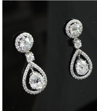
DROP EARRINGS £7,500