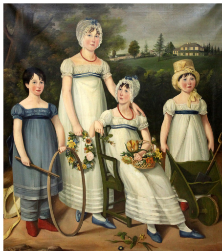
AMERICAN SCHOOL £7,000