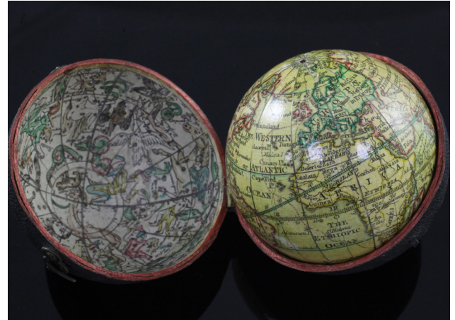
1776 POCKET GLOBE £3,800