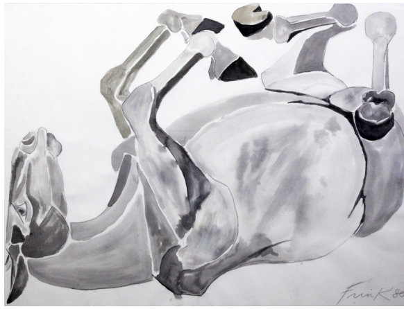
ELIZABETH FRINK £11,000