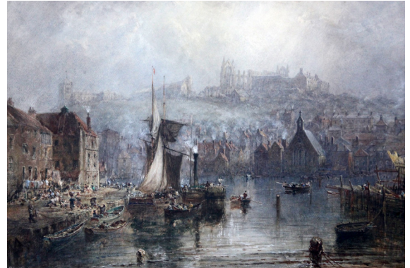
GEORGE WEATHERILL - WHITBY £7,200