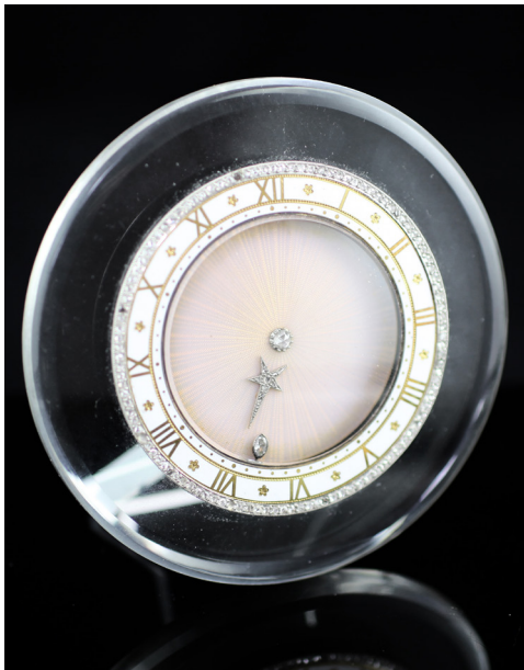
CARTIER MYSTERY CLOCK £38,000