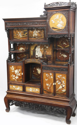
MEIJI CABINET £5,000