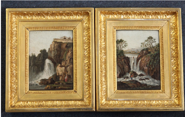
MICRO-MOSAIC PLAQUES £6,500