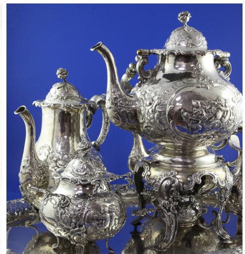
HANAU SERVICE £3,800

Interiors & Approachable Art - August 23rd - Deadline August 3rd.