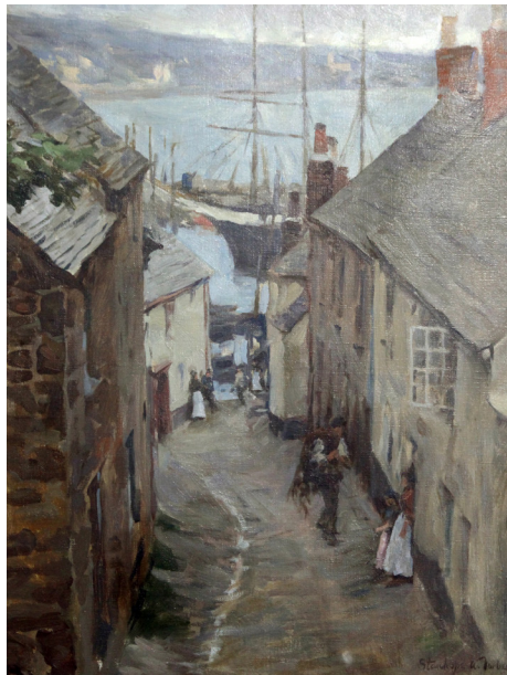
STANHOPE FORBES - NEWLYN £22,000