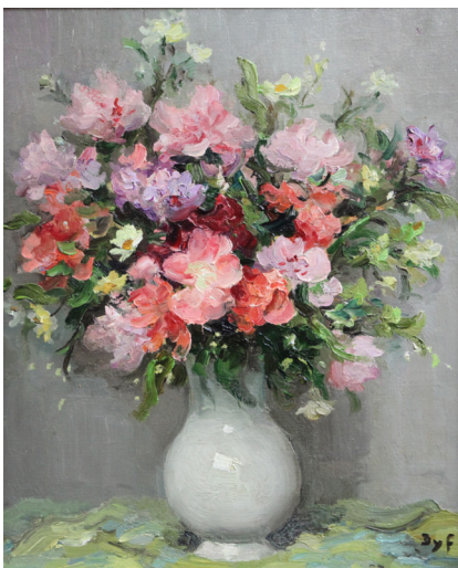
MARCEL DYF - GODETIAS £7,500