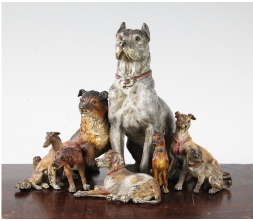
COLD PAINTED BRONZE £4,200