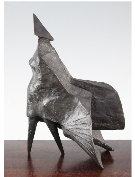
LYNN CHADWICK £21,000