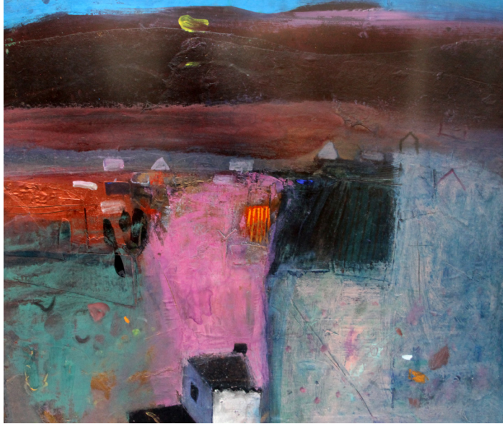
Barbara Rae (1943-) £7,500