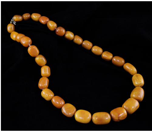
Amber bead necklace £16,000