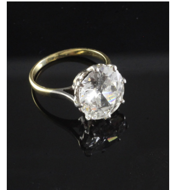
Solitaire diamond ring £7,500