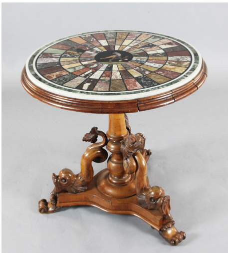
Italian specimen marble table £3,200