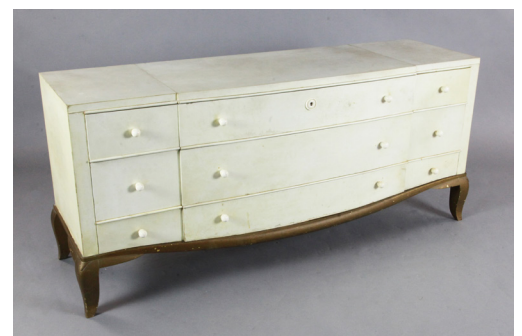
Andre Arbus commode £20,000