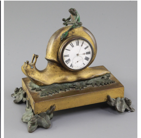
Unusual frog and snail timepiece £4,200