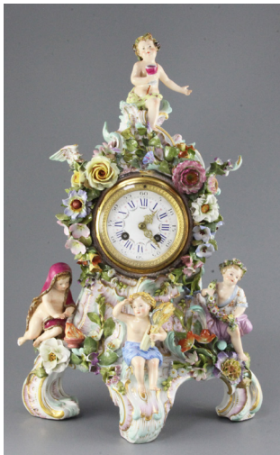
Meissen clock £3,800