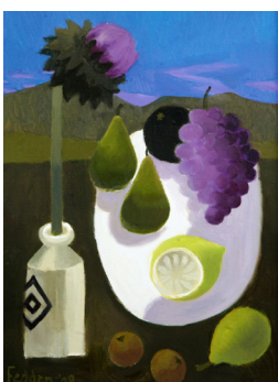
Mary Fedden (1915-2013) £7,000