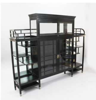
E.W. Godwin cabinet £15,000

April sees the Asian and Art sale on the 25th. The Summer Fine sale will be held on June 27th and the Weekly sales will continue every Monday.