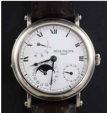
Patek Philippe £13,000