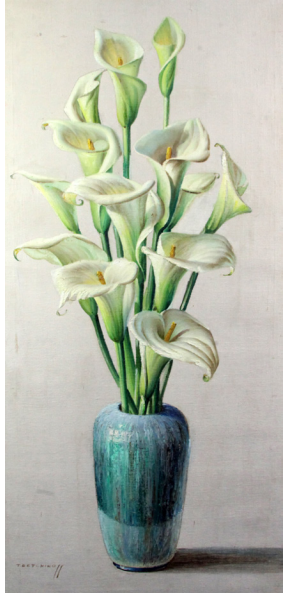
Vladimir Tretchikoff (1913-2006) £12,000