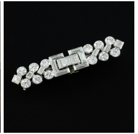
Cartier diamond brooch £4,400