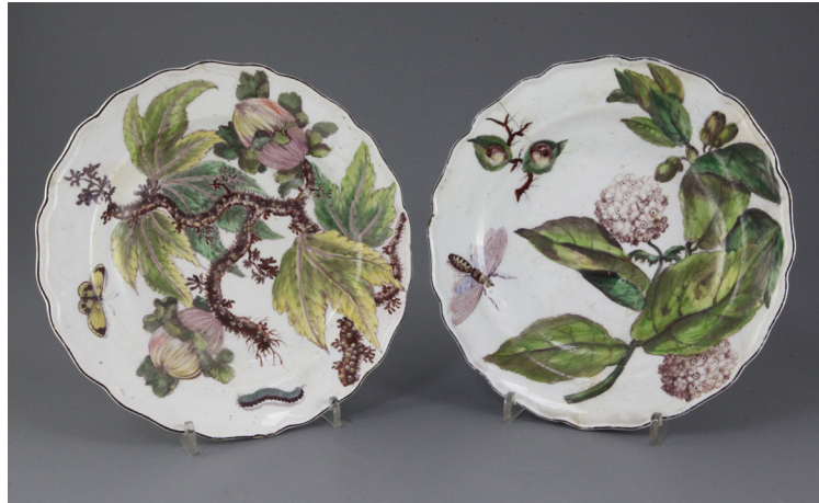
Pair of Chelsea 'Hans Sloane' botanical plates £4,600