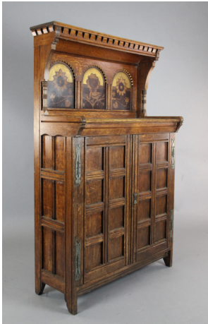
A.W.Blomfield chiffonier £7,000