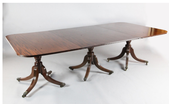
Regency dining table £7,200