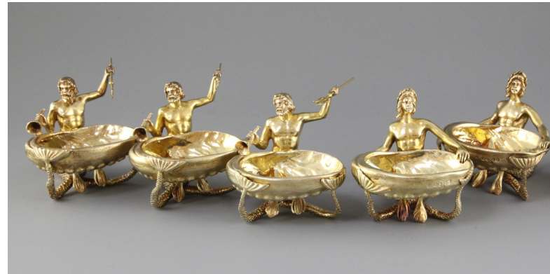
Set of 6 Victorian silver gilt salts £5,200