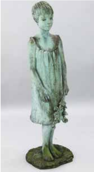
Marion Smith garden figure 'Aoife' £3,800

The eclectic selection of top lots selling in excess of £1,000 sums up the current market. Furniture has to be of notable quality and incorporate unusual or quirky design elements to generate interest in the saleroom. Collectables have to be rare and interesting examples, not the run of the mill. The rest remains in the doldrums with some remarkable bargains available for those who dare to buck the trend and buy 'brown'. Internet bidding is now close to 50% of all bids with a third of the buyers online, typically up against the remaining stalwarts in the room. That said the interesting blend of lots, roughly ordered chronologically rather than by category, led to a full room and a more rewarding auction experience for all concerned. Next week sees our Asian sale followed in June by the main Summer Fine Sale, entries for which close at the end of this month.