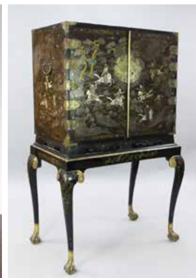
17th Century Chinese lacquer cabinet £4,000-6,000

Summer Fine Sale - June 21st/22nd - Deadline May 31st.