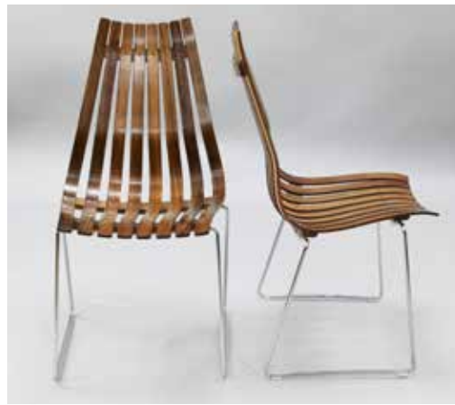
Set of 6 Hove Mobler Scandia chairs £1,300