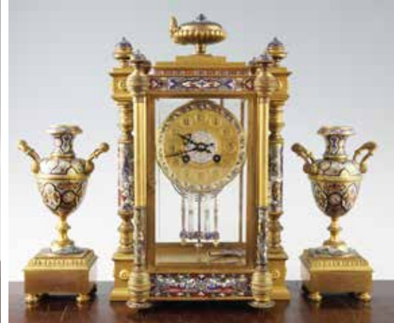
French clock garniture £1,400