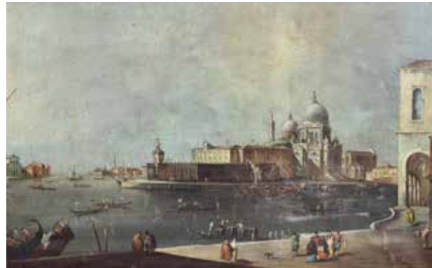
After Canaletto oil £1,200