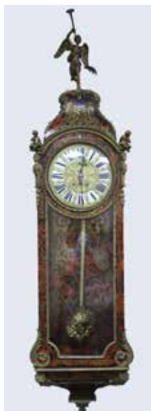
19th century French boule clock £2,200