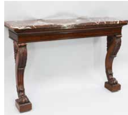
William IV console table £1,300