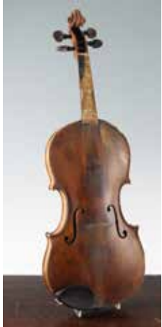
Violin attributed to Nathaniel Cross £1,300