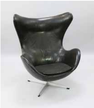
Fritz Hansen egg chair £1,400