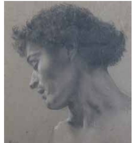
Frederick Goodall (1822-1904)- two drawings £2,200