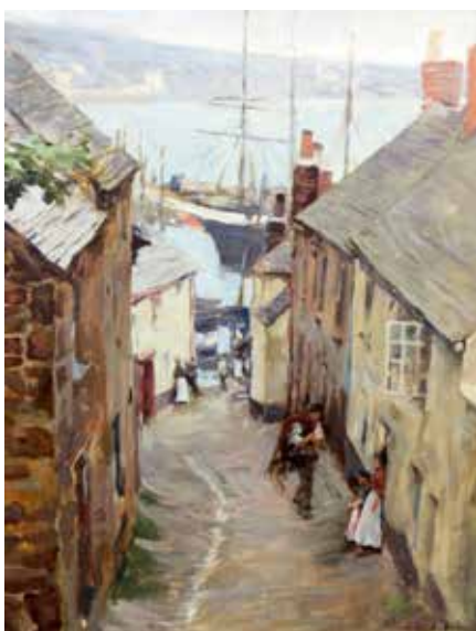
Stanhope Forbes (1857-1947) £10,000-15,000