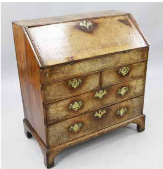
George I walnut bureau £1,500