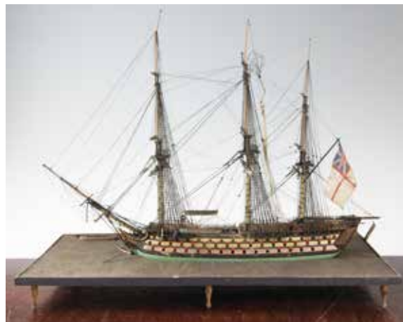
Early 19th century waterline model £2,200