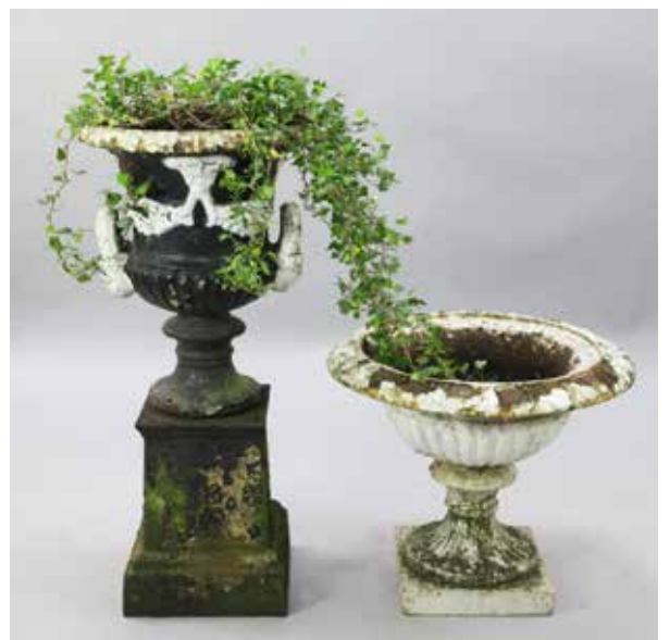
Two Victorian iron urns £1,400