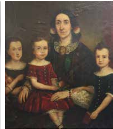
Spanish School portrait £1,200