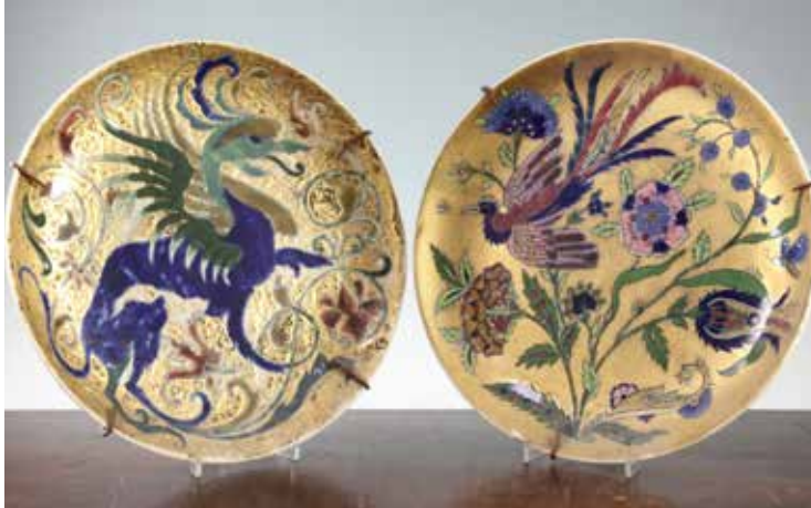
Two Zsolnay dishes £1,600