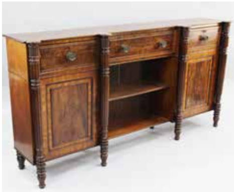
Regency dwarf bookcase £1,600