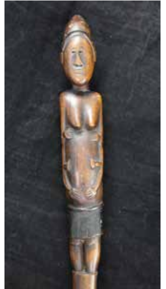
African carved wood walking stick £3,000

The eclectic selection of top lots selling in excess of £1,000 sums up the current market. Furniture has to be of notable quality and incorporate unusual or quirky design elements to generate interest in the saleroom. Collectables have to be rare and interesting examples, not the run of the mill. The rest remains in the doldrums with some remarkable bargains available for those who dare to buck the trend and buy 'brown'. Internet bidding is now close to 50% of all bids with a third of the buyers online, typically up against the remaining stalwarts in the room. That said the interesting blend of lots, roughly ordered chronologically rather than by category, led to a full room and a more rewarding auction experience for all concerned. Next week sees our Asian sale followed in June by the main Summer Fine Sale, entries for which close at the end of this month.