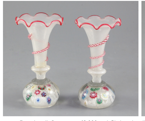
French millefleur vases £9,000 and Clichy inkwell £6,500