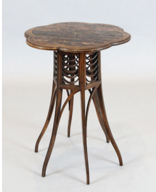
Lamb of Manchester table £9,000