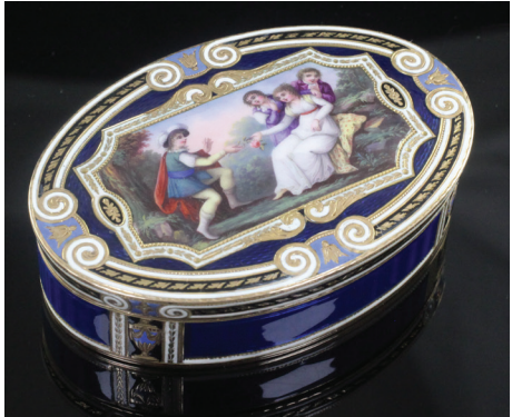
Swiss gold and enamel snuff box £7,000

GORRINGE'S 01273 472503 clientservices@gorringes.co.uk