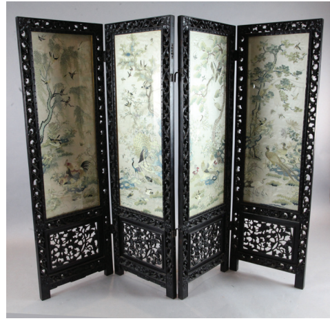
Chinese 'Hundred Birds' screen £9,000