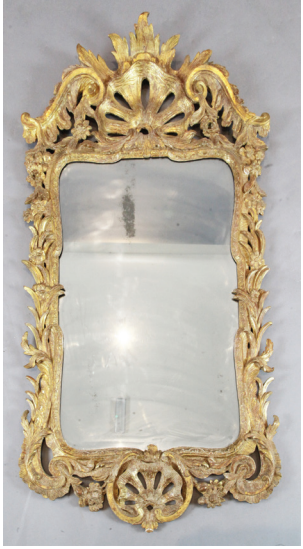
George II mirror £5,200 £9,000