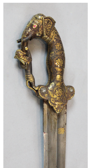
Indian tulwar £7,000