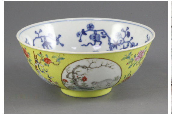
Chinese medallion bowl £7,500