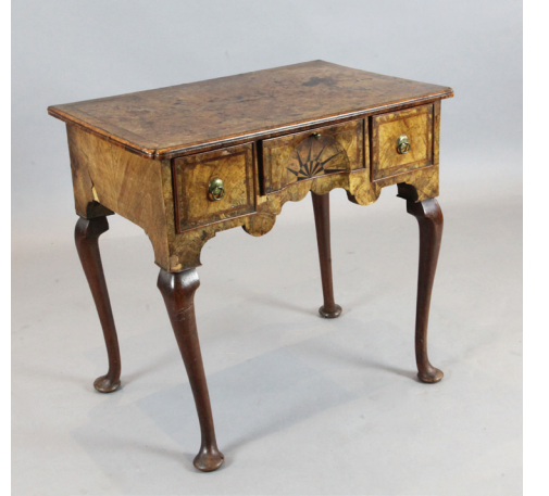
George I walnut lowboy £7,400