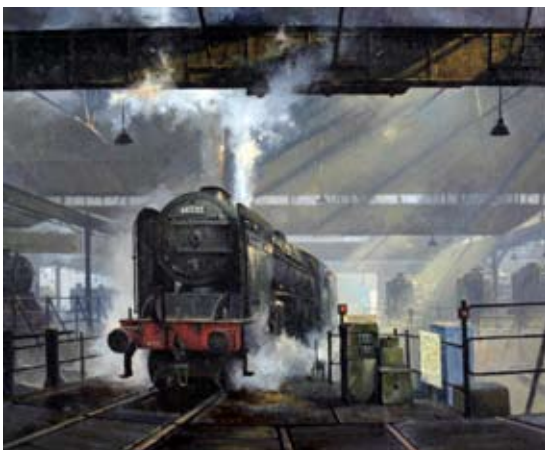
David Shepherd (1931-), oil on canvas, 'Straight Deal', signed, 16 x 20 in. Sold for £12,000