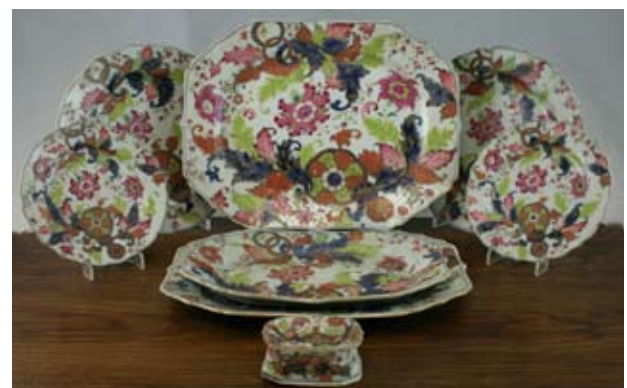
A 21 piece Chinese Qian Lung export tobacco leaf variant part dinner service. Sold for £8,000