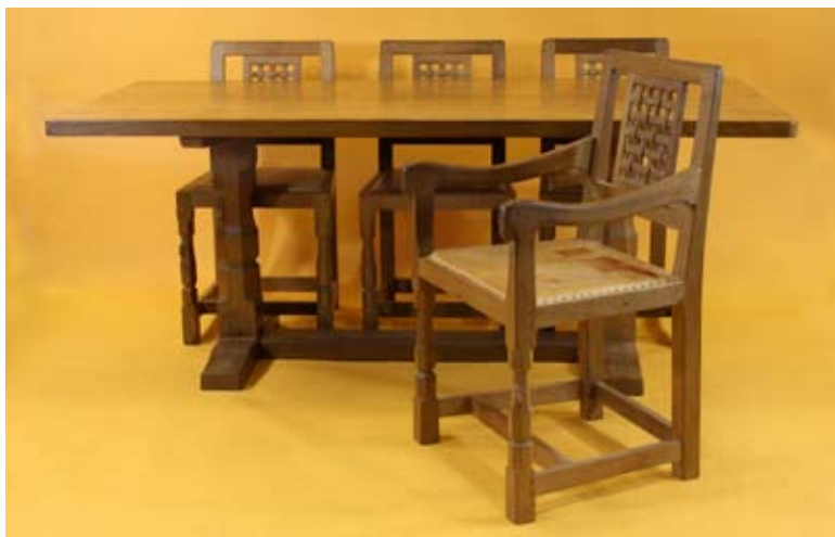
Robert 'Mouseman' Thompson, dining table and chairs H 1ft 3ins, W 1ft 4ins. Sold for £4,400