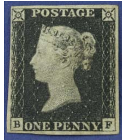
A stamp collection of Great Britain, mostly Victorian, including 23 Penny Blacks. Sold for £16,000