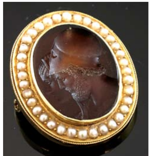
A 19th century Italian hardstone intaglio carved with classical heads and signed Matxant, 1.25ins. Sold for £4,000