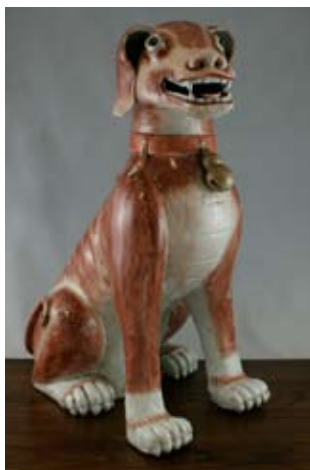
A Chinese porcelain model of a seated hound, 20.5ins. Sold for £7,000