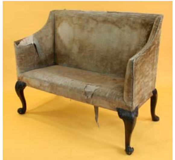
A George II two seater settee, W 3ft 7ins. Sold for £2,600