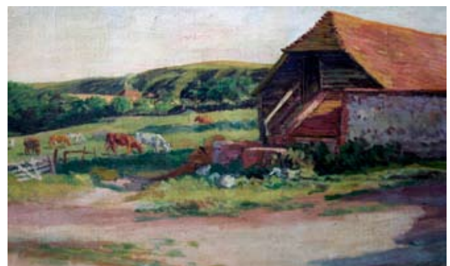
Duncan Grant (1885-1978), oil on canvas, Cattle and Granary (view from Charleston), signed & dated '48, 18 x 27 in Sold for £8,500