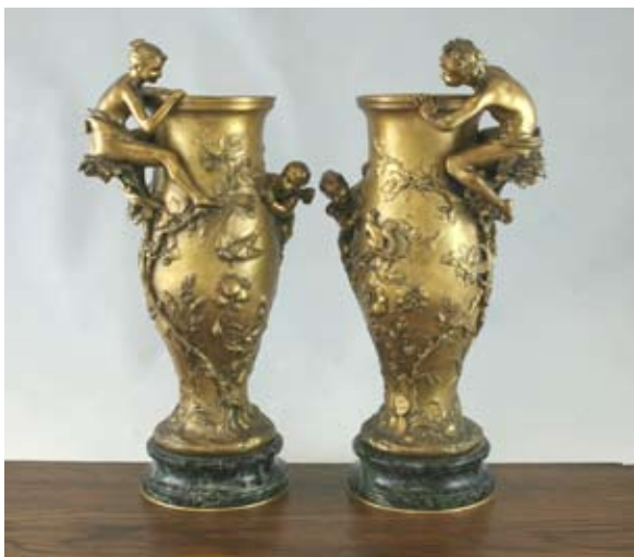
A pair of late 19th century French ormolu vases, Paris, 15ins. Sold for £2,500