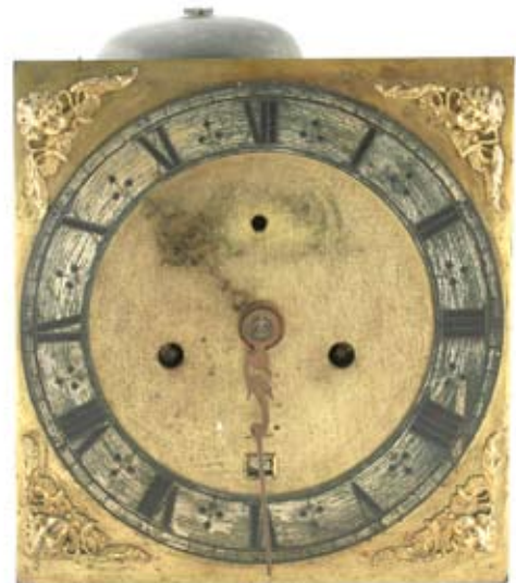
A late 17th century eight day bracket clock movement. Sold for £19,000