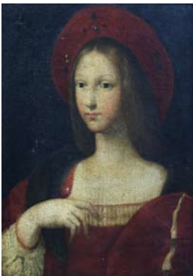
17th Century Continental School, portrait of a young woman wearing a red dress and jewelled hat, 24 x 19in. Sold for £6,500