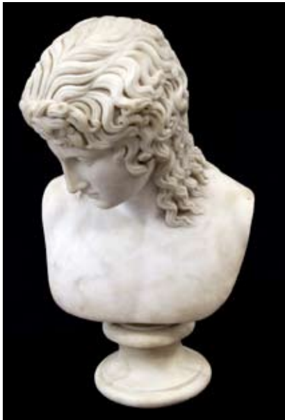
A 19th century carved white marble bust of a classical youth, 22ins. Sold for £3,000