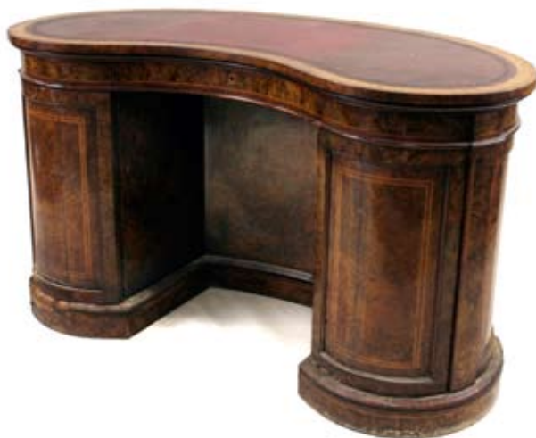
A Victorian banded burr walnut kidney shaped writing desk, 4ft 3ins x 2ft 4.5ins. Sold for £20,000