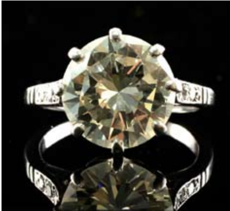
A platinum set solitaire diamond ring, the brilliant cut stone approx 4.77cts. Sold for £16,500