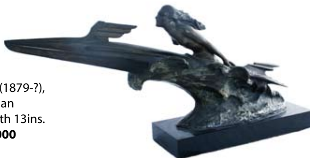
Frederic Charles Focht (1879-?), bronze sculpture, woman flying on a rocket, length 13ins. Estimate: £6,000-10,000

Fine Art, Antiques & Collectables Auction: 21st & 22nd Oct 2009