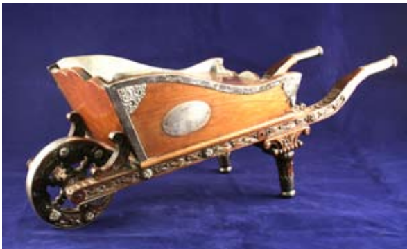
A Victorian silver mounted carved mahogany presentation wheelbarrow, length 24.5in. Sold for £3,500