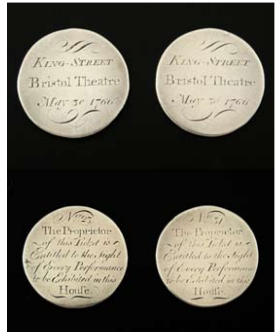
Right; A pair of George III silver tokens for the Theatre Royal Bristol, issued in 1766, which allow the user entry to any performance shown at the theatre. Sold for £2,100 each