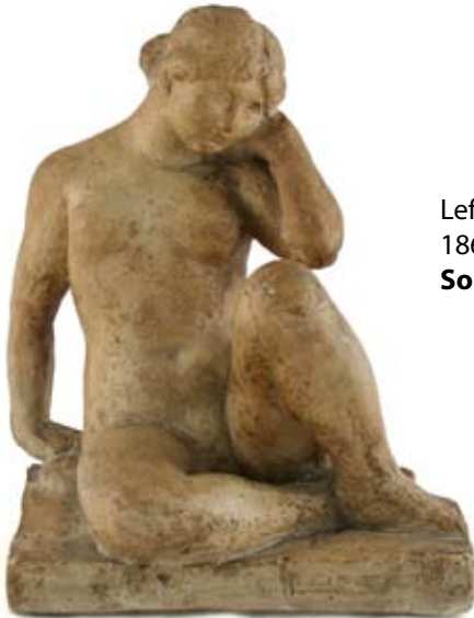
Left: Aristide Maillol (French, 1861-1944), 'La Mediterranée', 8.5in. Sold for £14,000