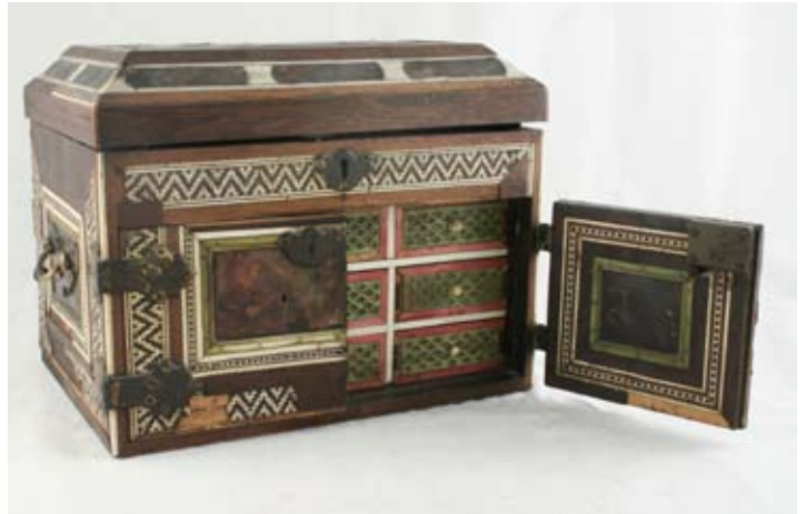
A late 17th century Indo-Portuguese table cabinet, 10ins - a.f. Sold for £4,300