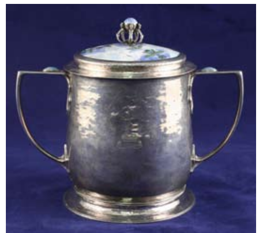
Right: An Edwardian Guild of Handicrafts Ltd silver and enamelled two handled cup and cover, in the manner of Ashbee, gross 36oz. Sold for £10,000